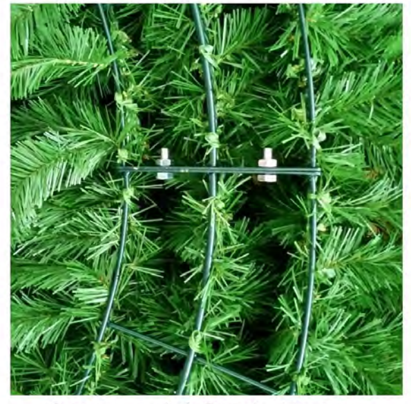
Commercial Grade Frame and PVC Noble Fir